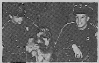
Rochester Police Officers with K-9 Corps dog who gave demonstration at Lodge.